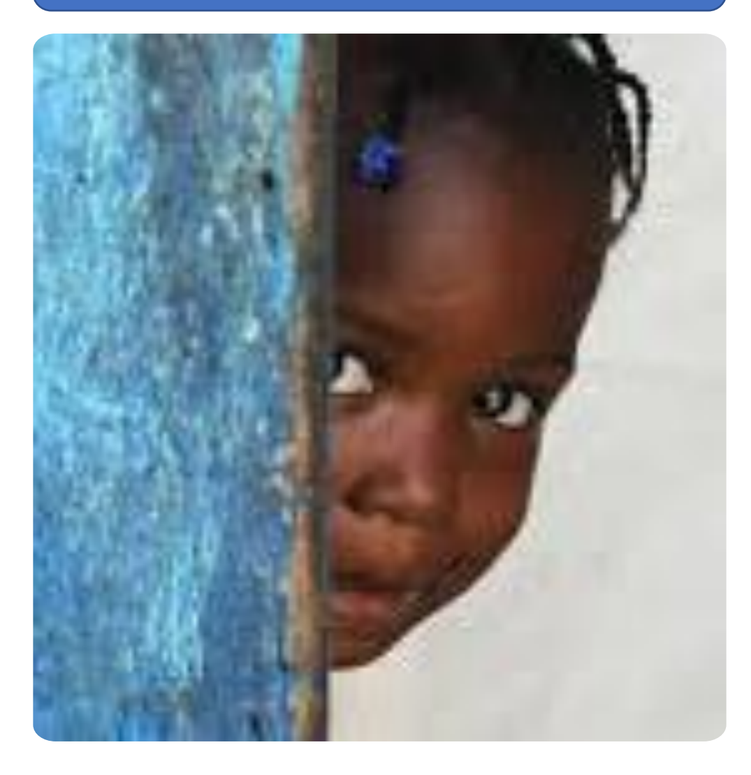
Why is Professional Curiosity Important?