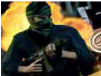
ISIS using imagery from popular video game 'Grand Theft Auto' to appeal to young people

There is one overriding priority for Prevent at the moment, which is to support those vulnerable individuals who sympathise with the group called ISIS / ISIL in Iraq and Syria and who may seek to travel and join them. ISIS is a particularly insidious group because their recruitment is targeted specifically at young people, using the language and imagery of video games and knowing that children and teenagers will not have the critical thinking skills to challenge distorted narratives